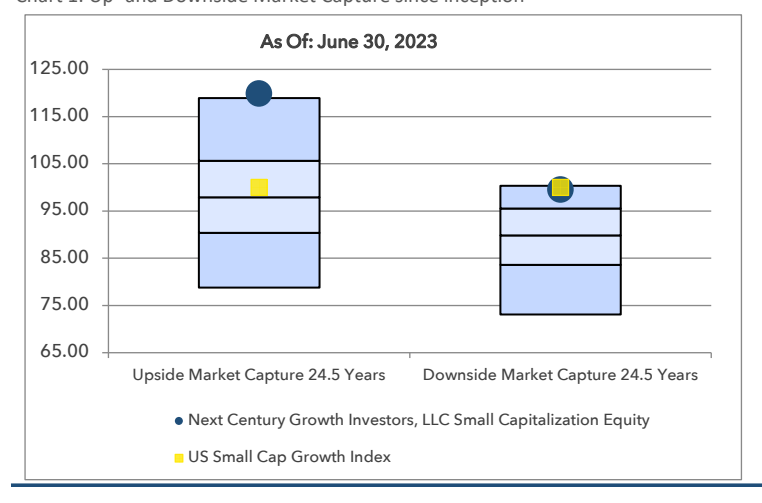
Chart 1. Up- and Downside Market Capture since inception

By investing in companies that have the potential to grow faster and more consistently than those in the benchmark, we believe that our portfolio will, over the long-term, perform better than the unmanaged index.